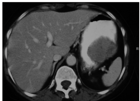
Figure 4: Contrast-enhanced computed tomography scan showing gastric mass with minimal extension into lesser sac