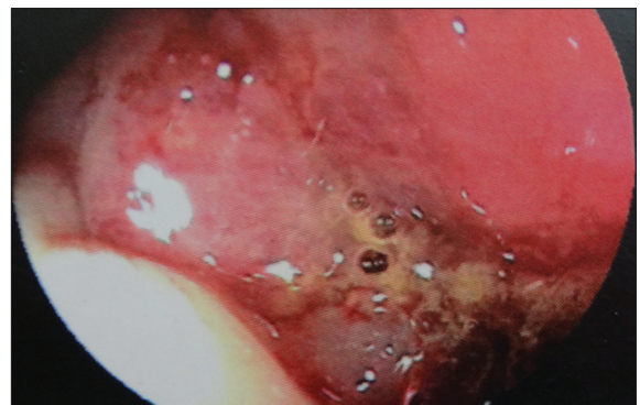
Figure 2: Colonoscopy image showing ulceration in the sigmoid colon