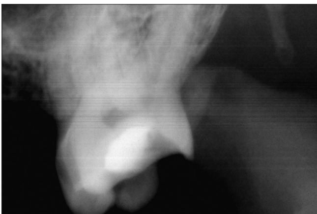
Figure 1: Pre-operative radiograph

A 28-year-old Indian male patient presented with pain, both spontaneous and temperature related, on the right side of the face for several days. The patient's medical history was non-contributory. Clinically, the right maxillary second molar had a deep carious lesion. Electric pulp testing (Vitality Scanner; Analytic Technology, Glendora, CA) was indicative of irreversible pulp damage. The clinical diagnosis was irreversible pulpitis. A pre-treatment radiograph was taken, [Figure 1] and conventional coronal access was performed. The patient received local anesthesia of 2% lidocaine with 1:100,000 epinephrine. After removing pulpal tissues located in the pulp chamber, clinical evaluation of the internal anatomy revealed 3 principal root canal systems: MB, distobuccal (DB), and