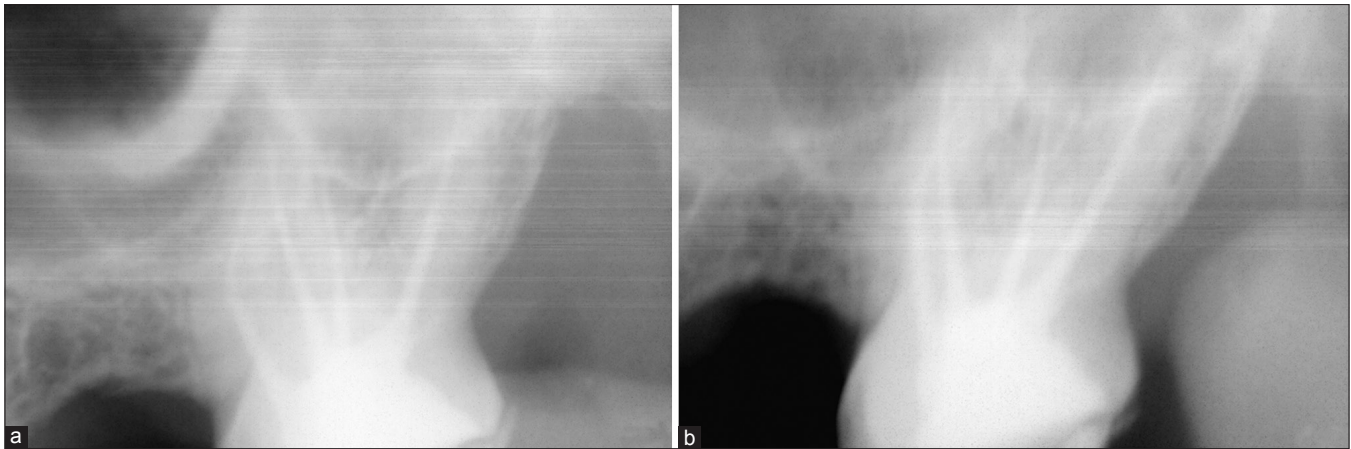
Figure 3: Post-operative radiographs (a) immediately after treatment, (b) after two months

canal. The majority of endodontic literature describes the maxillary molars as having 3 roots with 3 or 4 root canals. [12] The prevalence of maxillary second molars with 2 palatal canals is rare. Also, literature is scarce regarding presence of 2 separate palatal roots, which have canals with separate orifices and separate foramen.