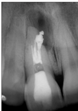
Figure 5: After filling, the final radiograph showed the 4 root canals