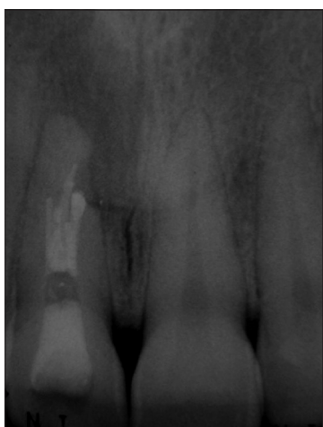
Figure 6: 12 month follow-up

the “typical morphology” of any tooth are easily found. However, case reports presenting variations and/or irregularities of the pulp space are not easily found, but they should be, in order to help similar cases.