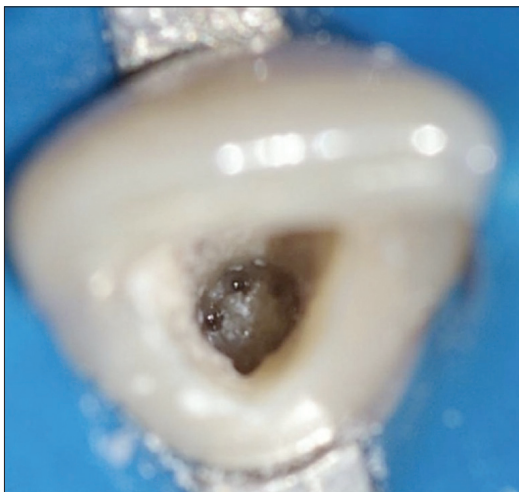
Figure 3: Root canal divided into 4 canals