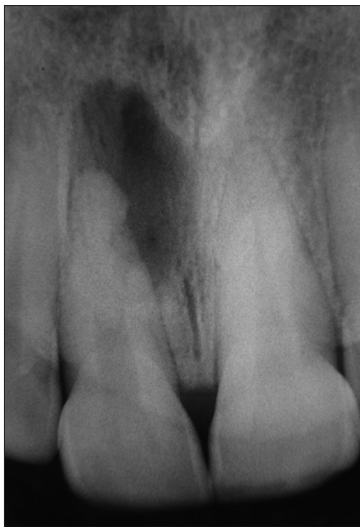
Figure 1: Radiographic exam revealed radiolucency around the root canal, an unusual root anatomy, and external root resorption

According to Leonardo, [11] an inability to detect, locate, negotiate, and instrument all root canals may lead to endodontic failure. Textbooks describing details of