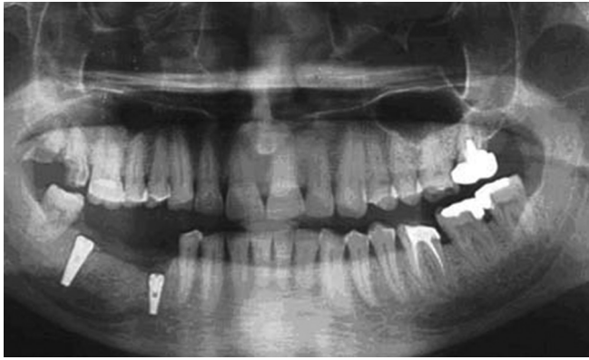
Figure 5: Post-operative orthopantomogram - after 12 weeks