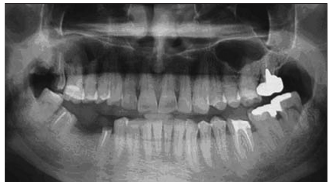
Figure 2: Pre-operative orthopantomogram showing periapical pathology in relation to tooth no. 47