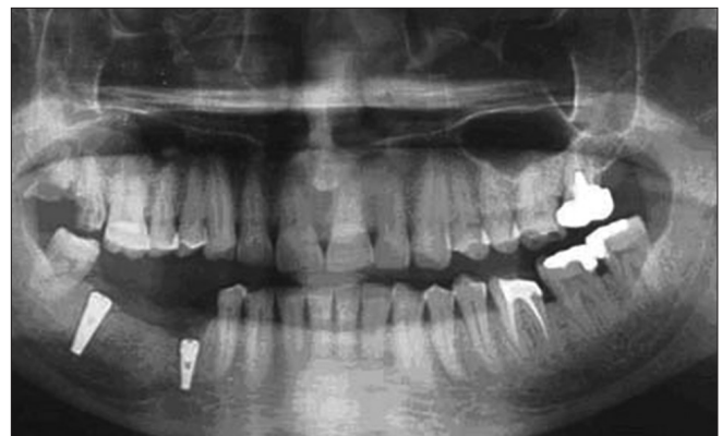
Figure 4: Post-operative orthopantomogram - after 6 weeks