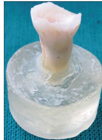
Figure 1: Fractured extracted central incisor

Freshly extracted human canines, without fractures or cracks, were selected to construct the biological posts core. Using diamond disk, the crown portion were separated from root portion followed by removal of apical third portion of root. Thereafter, roots were sectioned mesiodistally [Figure 3] along the long axis of the tooth.