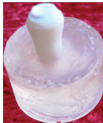
Figure 3: Endodontic preparation and post space preparation

Using diamond abrasive points, each part of the root was cut in such a way to form biological post core. Prepared dentine post core was checked time to time to get a snug fit of prepared post space while making same oriented shape, thickness, and length of dentine post. The coronal