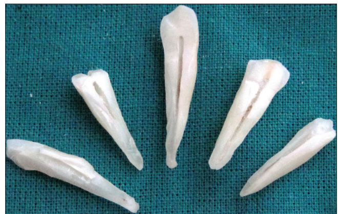
Figure 2: Mesio-distal sections of extracted teeth for biological post and core preparation