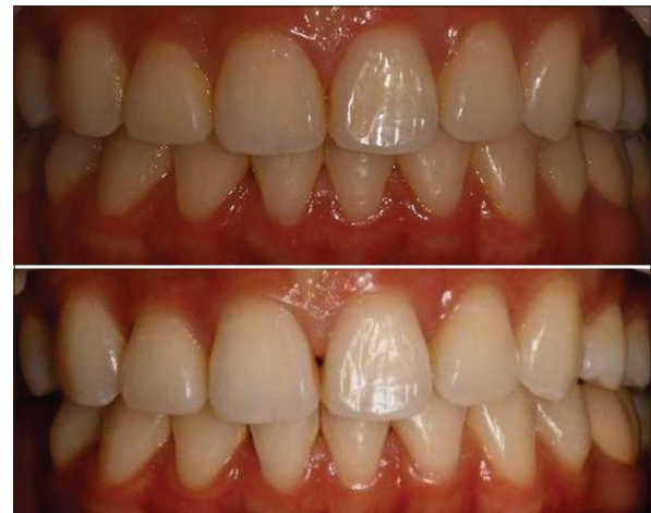
Figure 1: Shade improvement after home bleaching treatment with 10% carbamide peroxide

Bleaching agents may cause chemical softening, and reduce the durability of resin composite restorations. [7] Bleaching prior to the placement of restorations of resin composites may reduce adhesive and resin to enamel bond strengths. [8]