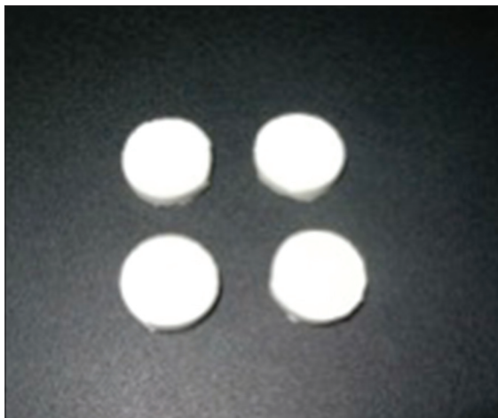
Figure 2: Dental stone samples

Type IV dental stone was mixed according to the proportion recommended by the manufacturer and poured into the perforations of the matrix so that the plate was kept onto a dental stone vibrator during this procedure. After the material setting, the dental stone pastilles were removed from the device and subjected to the mean roughness analysis [Figure 2].