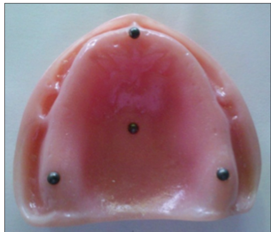
Figure 3: Chemically-activated acrylic resin master mold

With the aid of a coordinate-measuring machine (Brown and Sharpe), the reading of the acrylic resin master mold