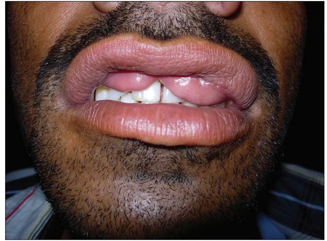
Figure 2: Anomaly became more prominent on smiling