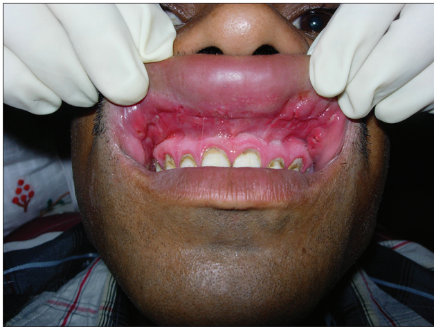
Figure 3: 1-week postoperative clinical photograph