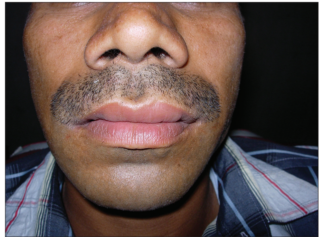
Figure 4: Postoperative photograph showing marked aesthetic improvement