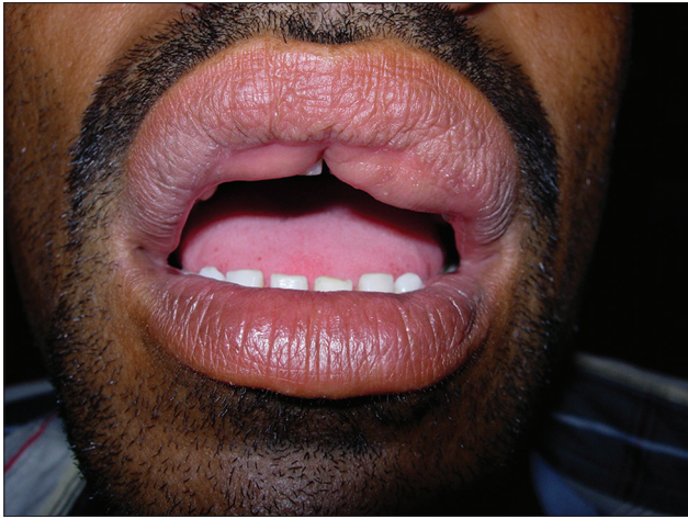
Figure 1: Clinical photograph of maxillary double lip