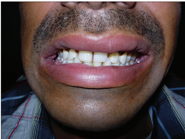
Figure 5: No anomaly visible even on smiling after surgery