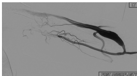
Figure 3: Digital subtraction angiography of the left brachiocephalic fistula postangioplasty at the end of the procedure showing improvement in the morphology of the fistula