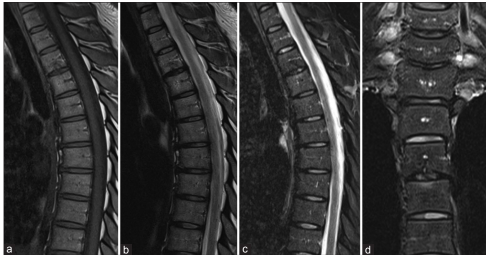
Figure 4: Follow-up magnetic resonance imaging obtained 1 year after the onset of severe pain, sagittal T1-weighted (a), T2-weighted (b), sagittal (c), and coronal (d) T2-weighted with fat suppression images confirm resolution of calcified Schmorl's node and disappearance of bone marrow edema in T3 vertebral body

demographic data (i.e., gender and age of the patient), level of involving spine, symptoms of patient, location or extension of calcified disc, probably precipitating event, the presence of bone marrow edema on MRI, the occurrence and follow-up time of spontaneous regression, treatment, and outcome of patient.