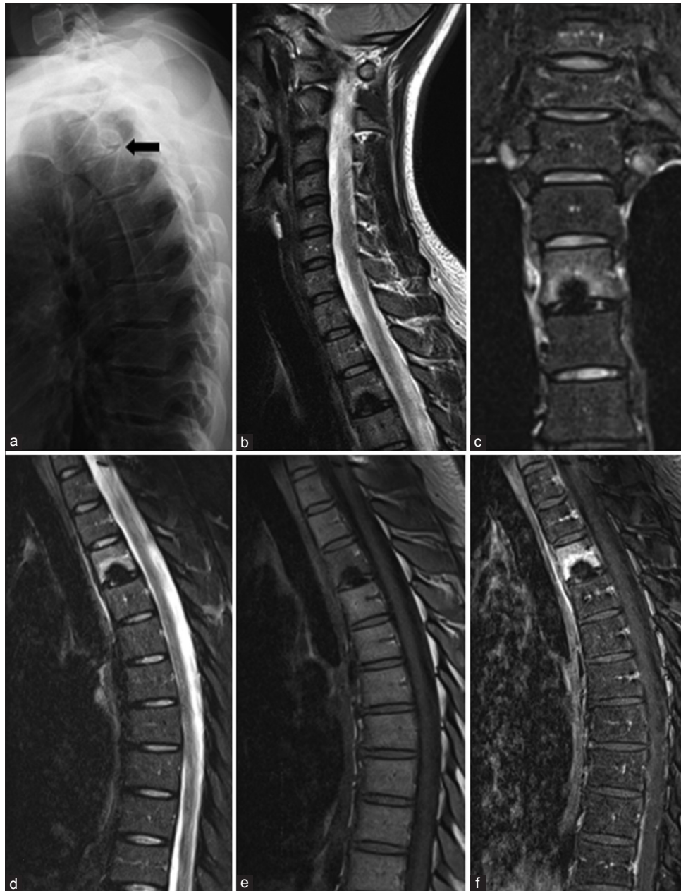
Figure 1: Lateral view of plain radiography of the thoracic spine (a) shows calcification of the nucleus pulposus in the T3-4 intervertebral disc space (arrow). Sagittal T2-weighted image of the cervical and upper thoracic spine (b) reveals marked hypointense lesions at the T3-4 intervertebral disc and T3 inferior endplate. Coronal (c) and sagittal (d) T2-weighted image with fat suppression of the thoracic spine nicely demonstrate a well-defined hypointense lesion at the nucleus pulposus of T3-4 intervertebral disc protruding into the T3 inferior endplate, and diffuse hyperintensity of marrow edema within the T3 vertebral body, particularly around the inferior endplate. Sagittal T1-weighted image of the thoracic spine (e) also shows marked hypointensity of the T3-4 intradiscal lesion. There are intense and moderate enhancement of the T3 body on the post-contrast sagittal T1-weighted image with fat suppression (f). No enhancement of the T3-4 intradiscal lesion is noted

and hyperintensity on T2-weighted image of whole T3 vertebral body with vivid enhancement, representing with bone marrow edema. No abnormal paravertebral soft-tissue involvement was found [Figure 1b-f]. Subsequent CT scan of the thoracic spine also disclosed calcification of the T3–4 nucleus pulposus, migrating through the inferior endplate of T3 vertebral body [Figure 2]. Her severe pain was controlled with intravenous parecoxib sodium 40 mg twice a day for 3 days. The pain was also treated with multidrug therapy, including etoricoxib 90 mg once a day, pregabalin