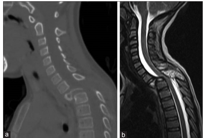
Figure 1: (a) The computed tomography scan with sagittal reconstruction of spinal column and (b) sagittal T2 images sequences before surgery

In our case, the patient was only 7 years old with lower limb paresis and spinal kyphosis. To achieve total resection, spinal reconstruction, and fusion, a three-stage surgical approach was performed including posterior resection, anterior resection/fusion, and posterior fusion. Regarding