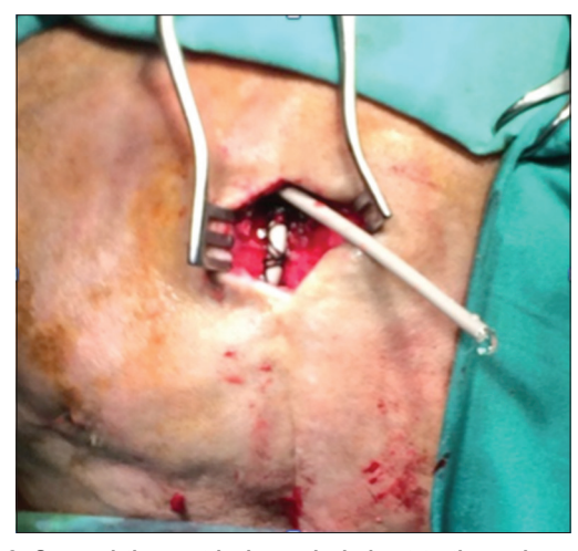
Figure 2: Secured the ventriculosugaleal shunt to the periosteum with suture