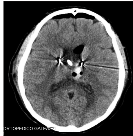
Figure 2: Pneumocephalus with widening of ventricular system

pneumocephalus clinical observation and intravenous hydration is sufficient; however, in case of hemorrhage radiological follow-up or surgery should be considered. We advise a close observation in cases of hemorrhages near the ventricular wall as hemorrhage extension into the ventricular system might lead to acute hydrocephalus.