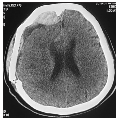
Figure 2: Postoperative computed tomography scan showing good evacuation of epidural hemorrhage, small new postoperative epidural hemorrhage with hyperdensity (HU 78) indicating the correction of hypofibrinogenemia in postoperative period

evacuation of the extradural hematoma with reduction in mass effect and restoration of midline shift [Figure 2].