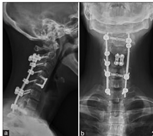
Figure 3: Follow-up imaging. (a) Lateral plain radiograph at 2 years follow up. (b) Anteroposterior plain radiograph