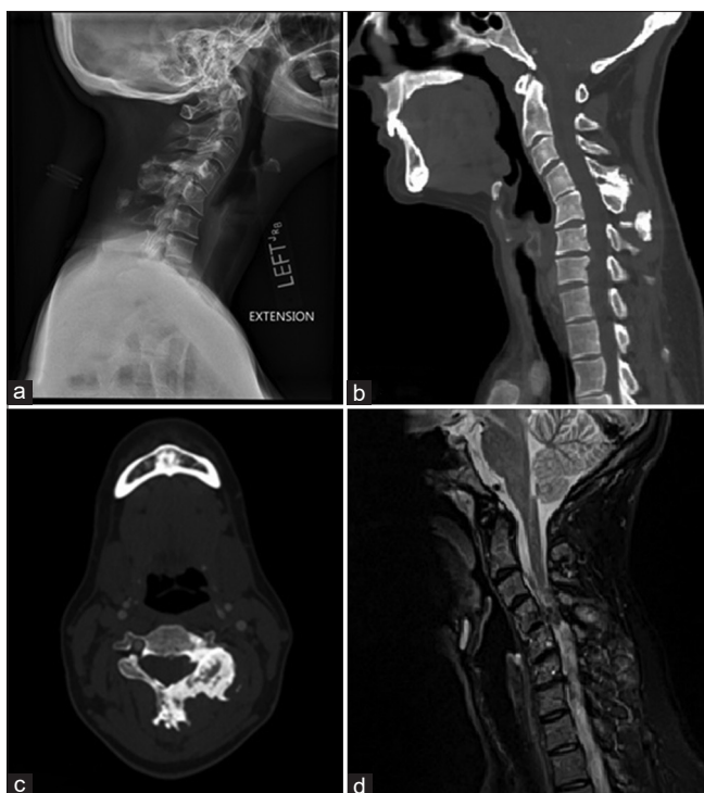
Figure 1: Preoperative imaging: (a) Lateral plain radiograph showing degenerative kyphotic changes as well as abnormal ossification of the posterior elements at C4–5 and C5–6. (b) Sagittal computed tomography scan showing the same findings. (c) Axial computed tomography scan showing large left side osteophytic growth involving the lateral mass and spinous process. (d) Sagittal contrast-enhanced magnetic resonance imaging showing cord compression and signal change