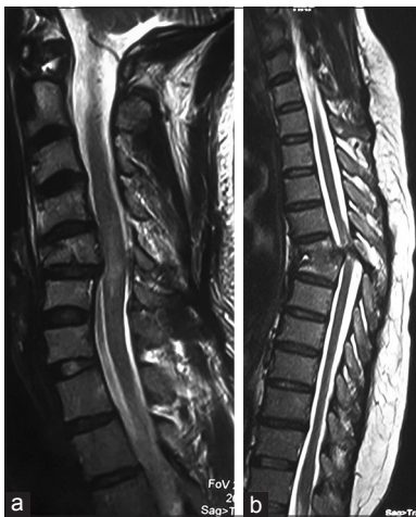
Figure 1: Magnetic resonance imaging T2-sagittal sections shows anterior wedge compression of C5 vertebra with cord contusion (a) and mid-dorsal fracture dislocation (b)