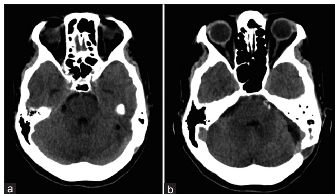
Figure 1: (a) Presence of air at the level of the cerebellum, and interpeduncular and crural cisterns and (b) Partial disruption of the posterior mastoid cells with left mastoid occupation, associated with a retrosigmoid bone defect

During the surgical procedure at the opening of mastoid cells, a cyst with CSF in its interior was found in the left retrosigmoid region. Cell sealing was performed using bone wax; dura mater was covered with fat and muscle grafts, in combination with primary anatomic closure of the