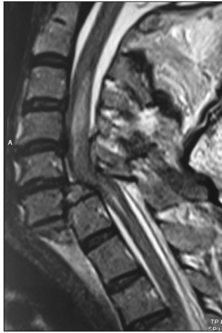
Figure 1: T2-weighted sagittal magnetic resonance imaging showing C6-7 dislocation with signal changes in cord