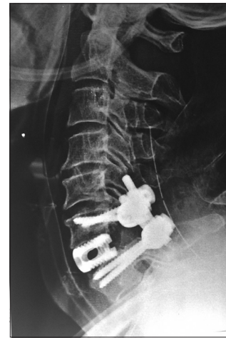
Figure 4: Postoperative lateral X-ray

good surgical outcomes. Removal of the lateral mass and lamina in this approach raised concerns of iatrogenic instability. However, now, we have an improvement in technique of safe placement of CPSs. This facilitates facet removal thus enlarging the zone of work. There is always a concern of iatrogenic injury to vital structures like the vertebral artery, as this approach entails a more lateral approach into the transforaminal area. This can be avoided by using the unciniate process as a landmark in the foraminal region.