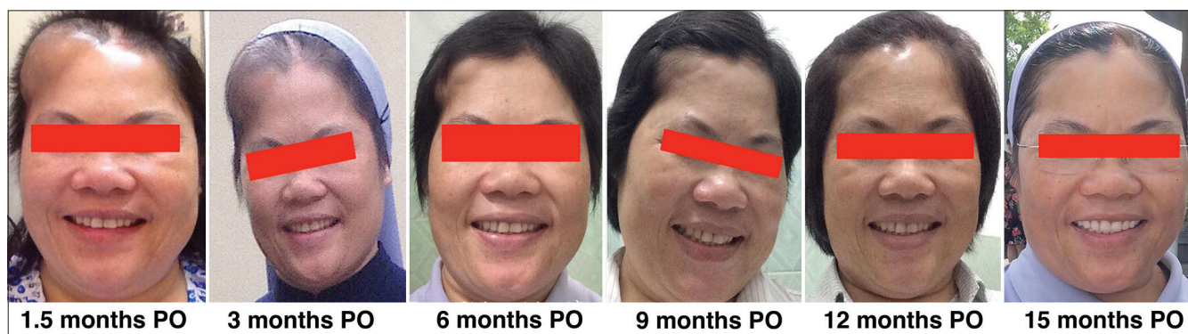
Figure 1: Evolution of postoperative frontal pseudomeningocele (PO: postoperative)

Typically, most pseudomeningoceles persist for days or weeks then promptly disappear within 1 or 2 days, indicating that the abnormal accumulation of CSF is temporary and could be reabsorbed completely. [10] However, infection, radiation, malnutrition, and increased CSF pressure may result in persistent pseudomeningoceles. [1] As there is no consensus in treatment strategy, pseudomeningocele, especially giant one may be managed differently among clinicians. The overall average opinion ascertained from an international survey of Tu et al. suggested that postoperative pseudomeningocele, without hydrocephalus, should be monitored for 7–14 days before re-exploration. [10] In case of hydrocephalus, 48% of neurosurgeons initially intervene with CSF diversion and would change the method if the lesion does not decrease within 2–4 days. [10] This survey concluded that initial follow-up was appropriate for cranial pseudomeningoceles. In case of failure with conservative management including pressure bandages, percutaneous fluid aspiration, bed rest, and CSF lumbar drainage, surgical intervention is recommended. [10,17,18] In case of postoperative ventriculomegaly, CSF shunting may be required if lumbar drainage has been failed. [7] For example, a report at British Columbia’s Children’s Hospital in Vancouver, Canada showed 73.5% of cranial pseudomeningoceles after posterior fossa surgery were