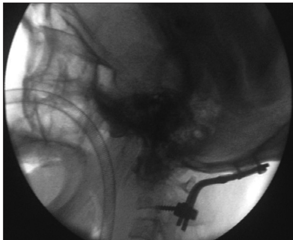
Figure 3: Peroperative fluoroscopy control

Several postoperative ventilator weaning attempts have been initiated. The patient died five days after surgery following respiratory complications.