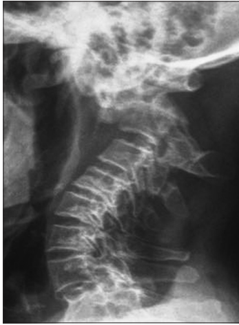
Figure 1: Sagittal plain radiograph showing a high abnormal gap between C1 and C2 spinous process suggesting a dislocation

cancellous grafts. The final fluoroscopic control was satisfactory [Figure 3].