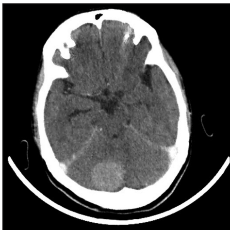
Figure 3: Preoperative axial computed tomography showing meningioma