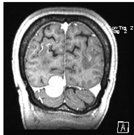
Figure 4: Coronal T2 magnetic resonance imaging showing tentorial meningioma with supratentorial and infratentorial meningioma

third-fifth decade, but they can present at both extremes of ages. Cyst size can range from 3 to 40 mm, but size may not be a reliable predictor of outcome as even small cysts may cause sudden death due to acute obstructing hydrocephalus or hypothalamic arrhythmias. They generally present with manifestations of ventricular outflow obstruction. The primary presenting complaint is headache. Associated symptoms include vertigo, memory deficit, diplopia, and behavioral disturbances.