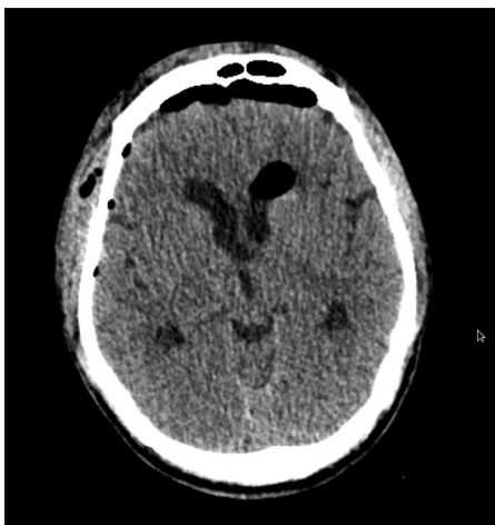
Figure 7: Postoperative computed tomography following excision of colloid cyst

are nonadjacent. This pattern of tumoral association most likely represents a coincidental event rather than the