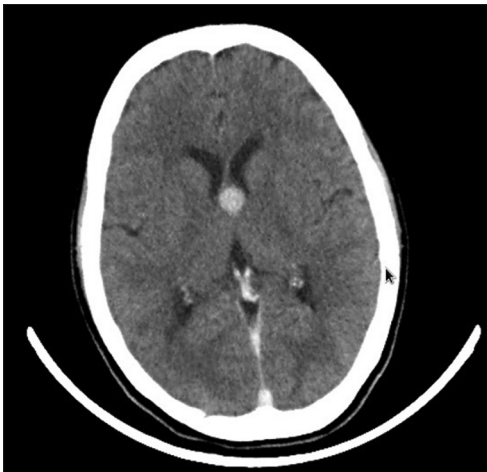
Figure 1: Preoperative axial computed tomography showing colloid cyst