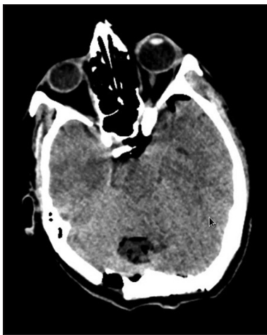
Figure 6: Postoperative computed tomography following excision of meningioma