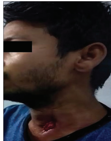
Figure 1: Clinical photograph revealing sprouting granulation tissue at the opening of the fistula located in the left suprasternal area

Implant loosening is known to occur following anterior cervical spine instrumentation. There are various case reports of oral extrusion of screw or plate loosening causing pharyngeal wall dehiscence. However, in our case, there was loosening of locking screw causing perforation of the cricopharyngeal wall which has not been reported till date. It was a sharp locking screw which migrated from the left to right side and invaded the cricopharyngeal wall from outside-in manner.