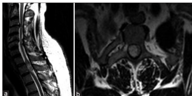
Figure 1: Preoperative magnetic resonance imaging. T2 Hyperintense Well-circumscribed mass within the spinal canal centered at the T2 level. The mass is intradural and compressing/displacing the cord laterally. Although it shows distinct hyperintense signal, a definitive determination of intra versus extramedullary could not be made due to close apposition. The mass shows internal T2 hypointense foci and rim representing hemosiderin depositions; a finding suggestive of cavernous malformation. (a) Sagittal view, (b) axial view

between 22 and 67 years, with a mean of 47 years. The majority of patients were male, representing a 70% of cases. In the same manner, the majority of cases (70%) were located in the mid-thoracic and lower-thoracic region. The presenting symptoms consisted of subarachnoid hemorrhage in three patients, sensorimotor disturbances in six patients, and one patient presenting with isolated back pain. Urinary disturbances consisting of sphincter dysfunction and urinary retention were also present in two patients in addition to sensorimotor disturbances. Gross total resection was achieved in nine patients, with only one case of subtotal resection due to significant adherence to the spinal cord. Excellent outcomes were obtained in six patients, no improvement was seen in two patients, and