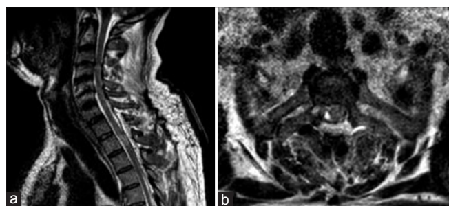
Figure 3: Postoperative magnetic resonance imaging. Gross total resection of previously identified hyperintense mass. (a) Sagittal view, (b) axial view