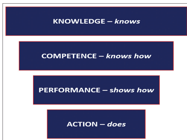
Figure 3: A representation of Miller's four-stage framework for clinical competence: action, performance, competence itself, and knowledge [54]

Aiming to evaluate not only knowledge but also decision-making and clinical reasoning, these – usually – multiple choice tests