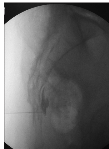
Figure 3: Fluoroscopy showed contrast injection at the retroperitoneal area

treatment, the patient came to our clinic again, and VAS score was 1–2. She resumed her normal daily activities, without taking any oral analgesics or opioids.