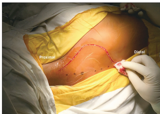
Figure 1: Semilunar incision: Ends of the incision slant toward the midline