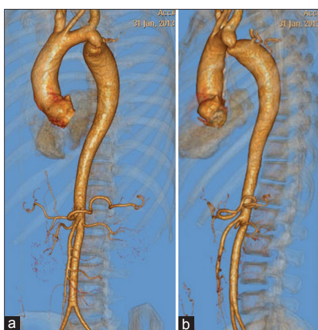
Figure 3: (a and b) Three-dimensional computed tomography angio of aorta showing postductal coarctation of aorta

balloon angioplasty for coarctation of aorta 3 months after clipping of the intracranial aneurysm and later underwent coarctoplasty with stenting for the treatment