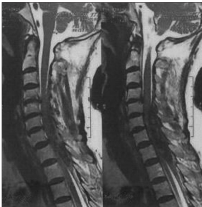
Figure 1: T1-weighted sagittal magnetic resonance images showing a mixed intensity acute hematoma compressing the spinal cord in epidural space at the C3-T1 levels

According to previous reports, emergency surgical treatment is indicated for better neurologic outcomes. [9] The neurological improvement depends on the severity of the symptoms before the surgery and the time between the onset of symptoms and the surgical intervention [11] as decompressive surgical treatment is effective if it is