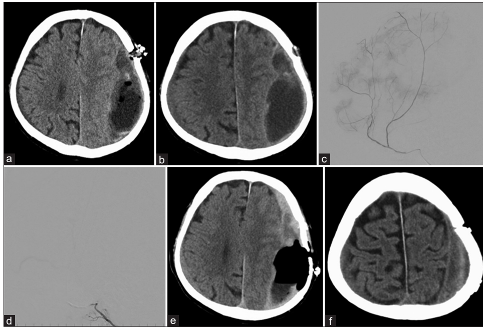
Figure 2: Perioperative images of Patient 2. A 77-year-old man (Patient 2) underwent a burr hole irrigation on the left chronic subdural hematoma (a). He was referred to our hospital for further treatment of an organized chronic subdural hematoma 2 weeks after the surgery (b). The abnormal vascular network of middle meningeal artery (c) was embolized using Embosphere® and coils (d). He underwent a craniotomy under local anesthesia (e), and his symptoms were relieved. Although the organized chronic subdural hematoma did not disappear 6 months later at follow-up (f), he is currently asymptomatic