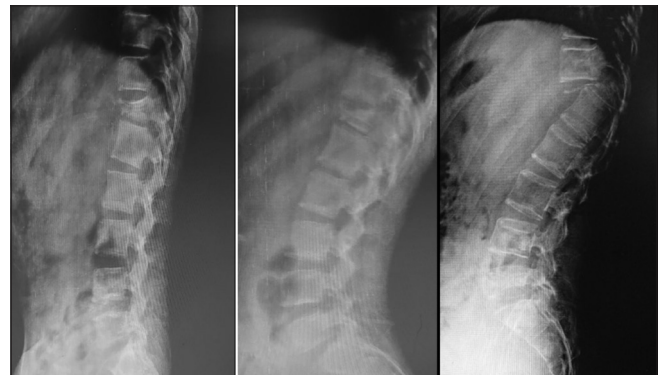
Figure 2: Sequential lateral radiographs of dorsolumbar spine done at 2 months, 4 months, and 6 months (from left to right) after starting multidrug-resistant antituberculous therapy showing gradual collapse of D12 vertebra at 2-month and 4-month radiograph whereas complete collapse at 6-month radiograph