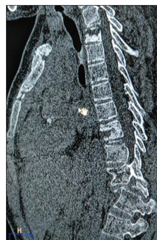
Figure 4: Six-month follow-up computed tomography scan showing lesions of C1–C2, C5, D2–D3, D9 were well consolidated except D12 region where D12 is totally destroyed with sagittal translation of D11 over L1, toppling, and significant spinal canal compromise with angular kyphosis of 30°

There are only five reported cases with extensive involvement in whole spinal regions in the literature. Turgut [3] reported a case with cervical, thoracic, and lumbar spondylitis. In this case, there was progressive quadriparesis and was treated by an anterior approach to the cervical spine and lateral retroperitoneal approach to the lumbar spine. Emel et al. [9] reported a case of noncontiguous