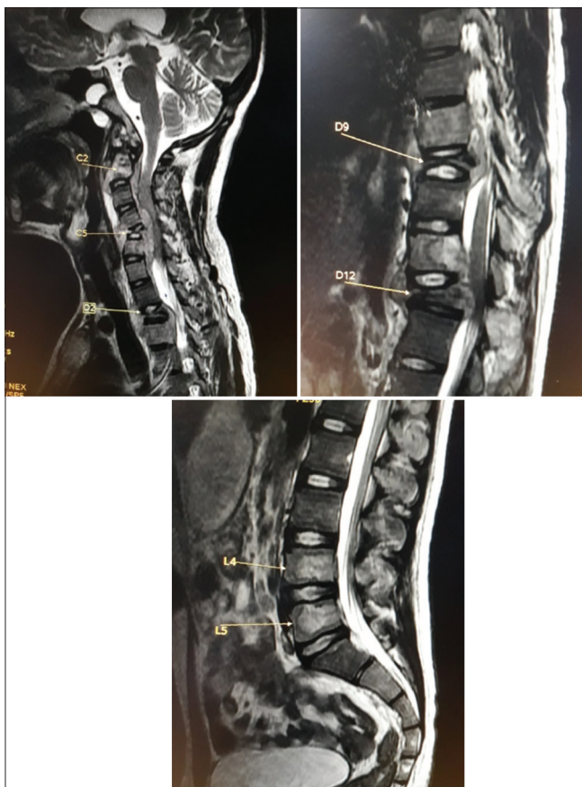
Figure 1: Magnetic resonance imaging of whole spine revealed granulation tissue around C1–C2 vertebral bodies, retropharyngeal abscess, destruction of C5 body with spondylodiscitis at C4–C5 and C5–C6 disc level, and epidural granulation tissue compressing the thecal sac around both C1–C2 and C4–C6 vertebral levels, signal intensity changes around vertebral bodies of D2–D3, D9, D12, L4, and L5, epidural abscesses compressing thecal sac around D2–D3, D9, and D12 vertebra, collapse of D2–D3, D9, D12 bodies, intensity changes in L4 and L5 vertebra were seen without any compression on thecal sac

Usually, two or more contiguous vertebrae are involved in spinal tuberculosis owing to hematogenous spread through one intervertebral artery feeding two adjacent vertebrae. [1] Noncontiguous multifocal tuberculous spondylitis is rare. Tuberculosis is not an uncommon disease in developing and underdeveloped countries. Its incidence is also increasing in developed countries because of immigration from underdeveloped and developing countries and increased incidence of human immune deficiency virus. [4] Tuberculous spondylitis occurs in 1% of the patients with pulmonary tuberculosis. [5] In the vast majority of the cases, lesions are at the thoracic and lumbar spine, and that at the cervical spine is present at about 5% of all tuberculous spondylitis cases. [6]