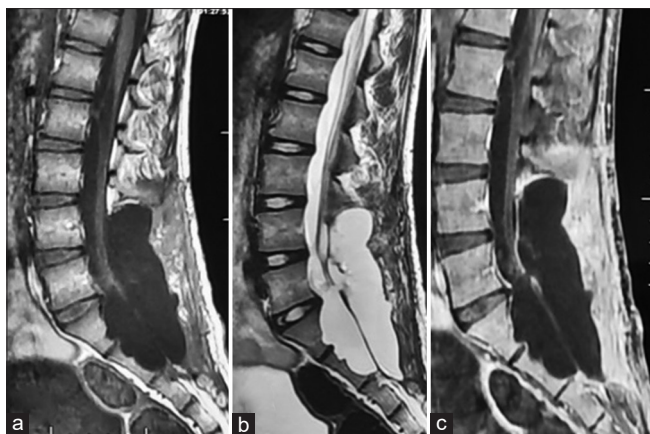
Figure 2: Postoperative images; follow-up magnetic resonance images at 6 months (a-c) showing no evidence of disease and a posterior pseudomeningocele