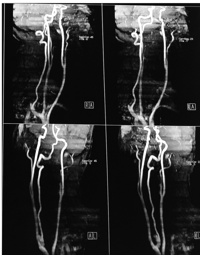
Figure 2: Computed tomography angiography showing absent flow in the left vertebral artery

statistically insignificant with P = 0.2547 [Table 3]. None of the patients showed signs of vertebrobasilar ischemia such as dizziness, vertigo, ataxia, blurred vision, and facial numbness.