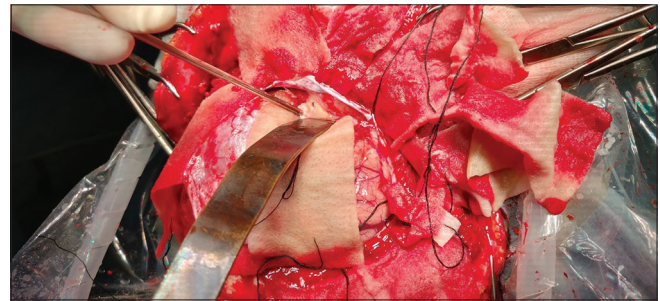
Figure 2: Intra-operative pus from frontal abscess in subfrontal approach

There are several predisposing factors of brain abscess such as immunocompromised state, preexisting medical