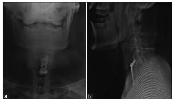
Figure 3: (a) Postoperative X-ray cervical spine, anterior-posterior view. (b) Lateral view, due to very short neck, lower screws are not visible

been reported that bone xanthoma can precede the onset of hyperlipidemia as long as 15 years and can be the first sign of dyslipidemia. [18]