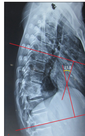
Figure 2: Cobb’s method of measurement of kyphosis

Patients operated by this technique were placed in the right or left lateral decubitus position based on the position