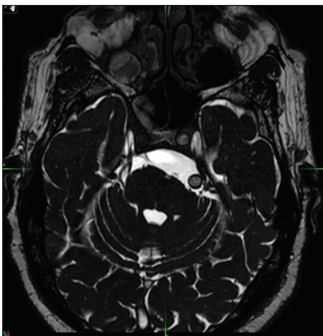
Figure 3: Axial section magnetic resonance imaging of the brain (constructive interference in steady-state series) showing the course of the trigeminal nerve