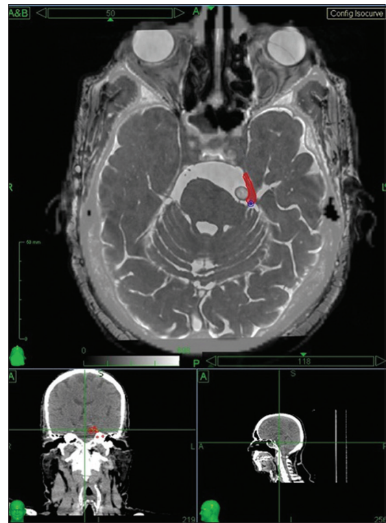
Figure 2: The above image is the fusion of the planning computed tomography scan and constructive interference in the steady-state sequence of magnetic resonance imaging, the red line is the target area that is the proximal nerve root entry zone