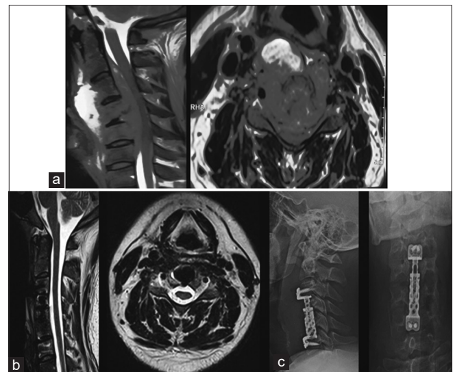
Figure 2: (a) pre-opt T2 W MRI Cervical spine, sagittal and axial images- showing isointense lesion with C4 body destruction and extension to epidural space with cord compression and also to prevertebral space. (b) post-opt T2 W MRI Cervical spine- showing complete resolution of lesion with no cord compression. (c) Post –opt X-Ray C spine lateral and antero-posterior view- C 4 Corpectomy with placement of expandable cage and cervical plate.

All the patients were started on antitubercular treatment (ATT), 2 months intensive phase (4 drugs, H – isoniazid [5 mg/kg], R – rifampicin [10 mg/kg], Z – pyrazinamide [35 mg/kg], and E – ethambutol [20 mg/kg]), followed by 3 drugs (H-Isoniazid, R-Rifampicin, Z-ethambutol) for 4 months followed by continuation phase (2 drugs, H- Isoniazid R-Rifampicin) for 12 months according to RNTCP guidelines. Postoperatively, patients