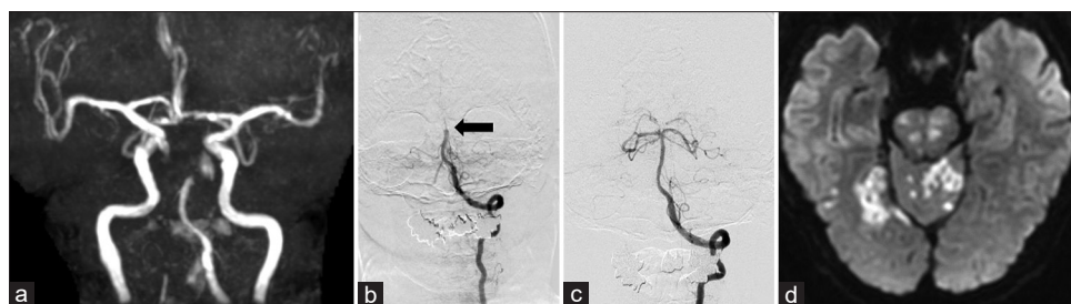
Figure 1: (a) Magnetic resonance angiography shows basilar artery occlusion (b) Preoperative cerebral angiography also shows basilar artery occlusion (black arrow) (c) Postoperative cerebral angiography shows the recanalization of the basilar artery (d) Diffusion-weighted image shows ischemic lesions on the cerebellum and brainstem