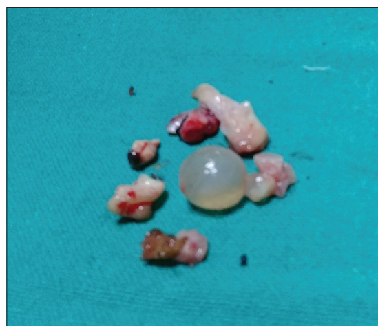
Figure 2: Intraoperative picture showing excised intact hydatid cysts