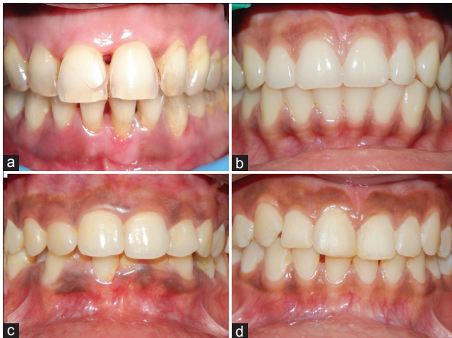
Figure 1: Depicting the intensity of gingival pigmentation (dummett oral pigmentation index) compared to years of exposure (a) no clinical pigmentation in <1 year of environmental tobacco smoke. (b) Mild clinical pigmentation in 5 years of environmental tobacco smoke. (c) Moderate clinical pigmentation in 10 years of environmental tobacco smoke. (d) Heavy clinical pigmentation in 15 years of environmental tobacco smoke

The results of this study revealed that prevalence of gingival pigmentation in young adults was directly proportional to the amount of ETS exposure. The previous studies did not take into consideration the environmental sources of ETS which add to the ETS burden. Apart from that the exact amount of time per