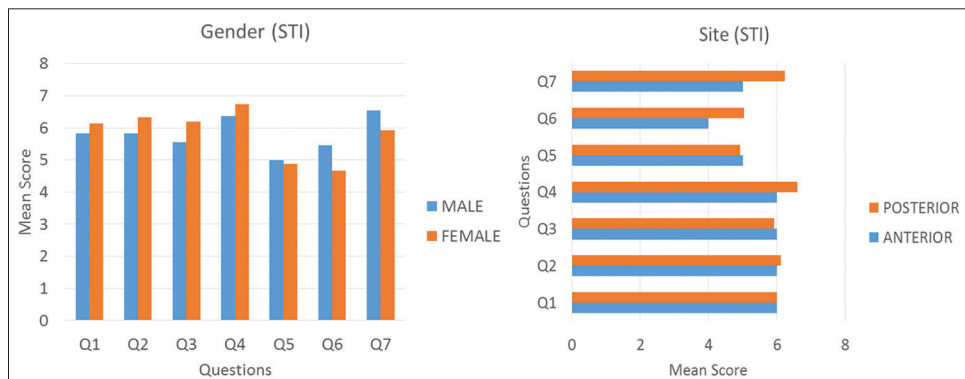
Figure 3: Mean score of each question for single tooth implant group in relation to gender and site