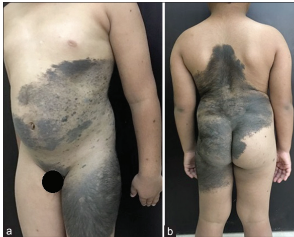
Figure 1: Large black macular lesions spread on the left side of the body including abdomen, pubic area, scrotum, and left thigh (a) scattered satellite lesions are seen. There is also a large black patch on the back, buttocks and left thigh (b)

significant findings on examination other than the congenital nevi. Electroencephalogram showed a borderline posterior rhythm slowing (could be a function of drowsiness); there were no epileptiform discharges. Based on his clinical and radiological findings, the diagnosis of NCM was made. He was not started on any treatment.