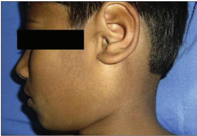
Figure 1: Preoperative image of the patient

and found to be neurofibroma after surgical excision and histopathological examination. The diagnostic problems, the biological behavior, and therapeutic management of this infrequent tumor entity are discussed.