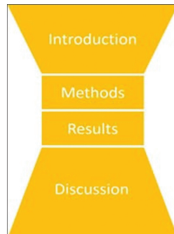
Figure 3: IMRAD structure of a research paper

Make sure you cite all the references you have used in your article. In the end, provide a detailed reference list of all the sources you have used.