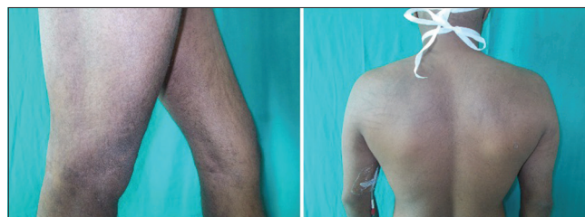
Figure 4: Subsidence of rash after treatment with bleomycin withdrawal and topical steroid application