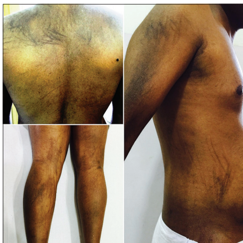
Figure 3: Flagette rash over back, legs, arms and trunk after bleomycin therapy