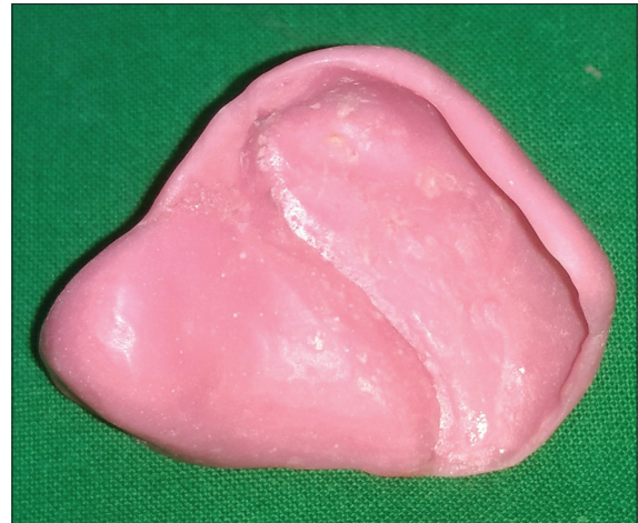
Figure 2: Custom tray obtained by duplicating the existing prosthesis