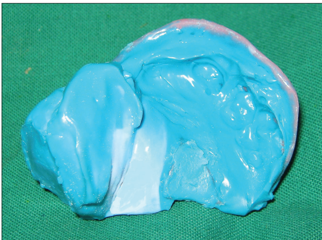
Figure 3: Definitive elastomeric impression