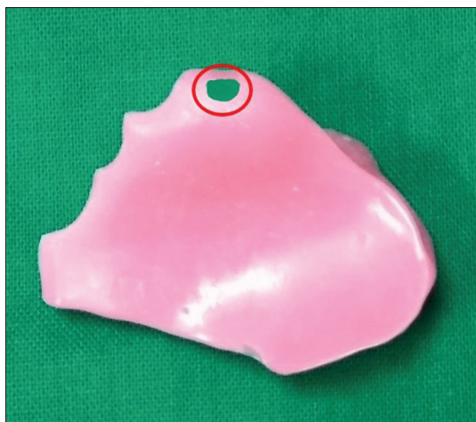
Figure 5: Final prosthesis with red circle showing provision to accommodate erupting deciduous incisor

Radiologically, the tumor is osteolytic in appearance with adjoining deciduous teeth appearing to be “floating” within the lesion. [12]