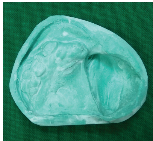
Figure 4: Master cast