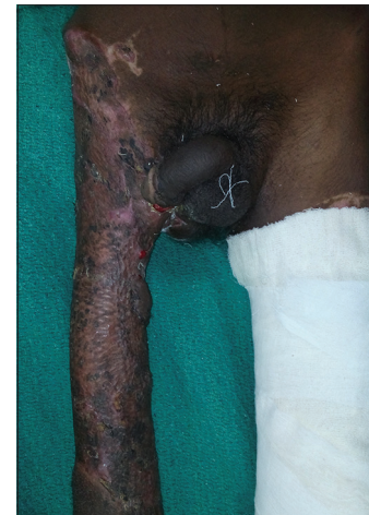
Figure 5: Post-operative after detachment of flap and inset