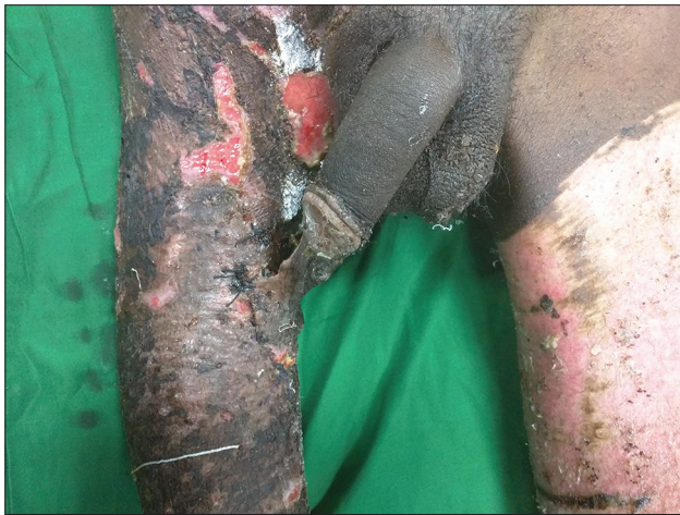
Figure 4: Attached preputial flap covering the repaired femoral artery

100% cover was achieved [Figure 4]. Post-operatively, the patient was kept sedated to avoid erection. Flap was detached on 21 st post-operative day [Figure 5].