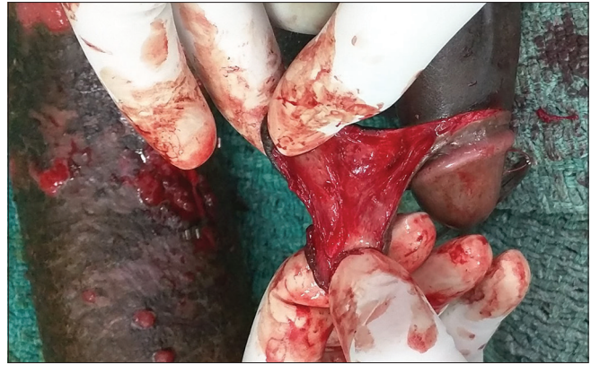
Figure 3: Preputial flap raised