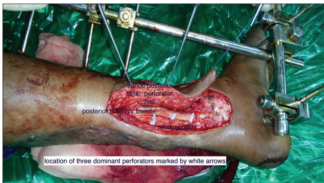
Figure 1: Short and straight cutaneous perforators from the posterior tibial vessels and they directly overlies the neurovascular bundle