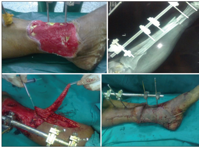
Figure 2: The Case 1 ad hoc posterior tibial vessel propeller flap for medium-sized defect in the lower third leg region (pre- and post-operative pictures)