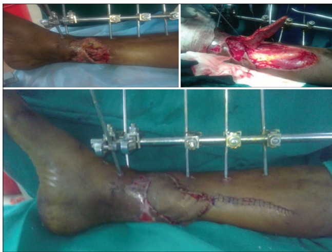
Figure 4: The Case 3 with ad hoc posterior tibial vessel perforator propeller flap with secondary defect closed primarily (pre- and post-operative pictures)