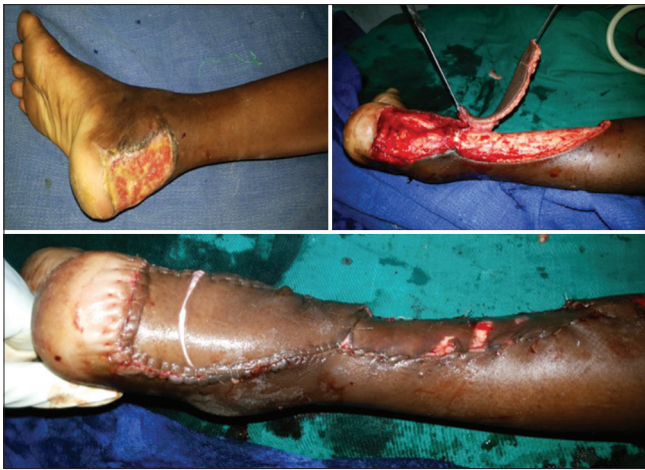
Figure 6: The Case 5 with tendoachilles defect covered by ad hoc posterior tibial vessel perforator propeller flap (pre- and post-operative pictures)