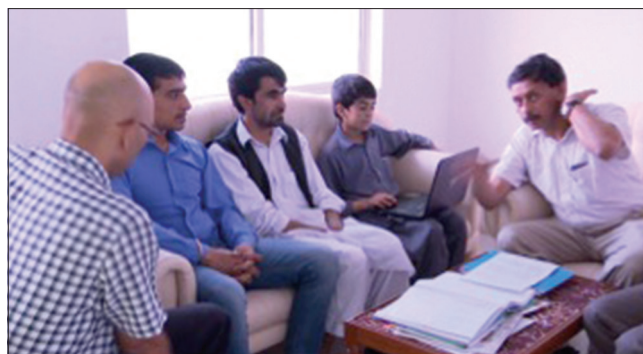
Figure 3: Family counselling sessions