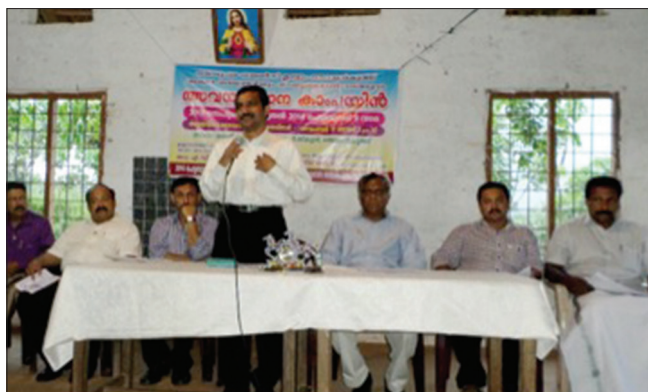
Figure 2: Public awareness meeting

and forearms, was kept available to be fitted to the body after procuring the hands. These were shown to the donor's relatives while counselling. All standard practices of donor family counselling were strictly adhered during the counselling procedure.