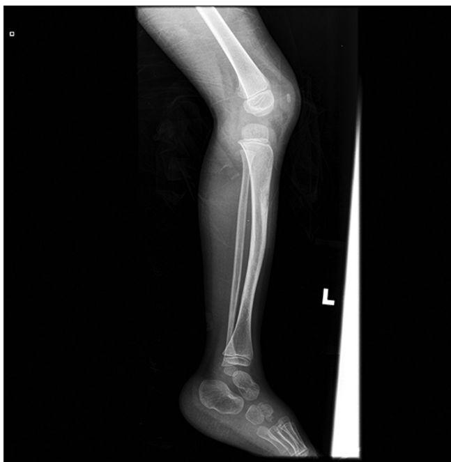
Figure 3: Lateral radiograph of left tibia and fibula of patient showing anterior bowing with increase in sclerosis and cortical thickening, suspected to be NF 1 related bone lesion

Several case reports had been published for cases with hypertensive crisis and reversible radiological changes in the cord, proposed to be a variant of PRES with spinal cord involvement. A total of around 10 such reported cases can be found in the existing literature. In 2014, Havenon et al. [4] reported two such cases and reviewed the literature of other six similar cases. They proposed the name PRES-SCI for this subset (PRES with spinal cord involvement). In their cohort of patients, abnormal T2W hyperintense confluent signal originated from cervicomedullary junction of spinal cord, some with entire cord involvement. All of them had elevated blood pressure with spinal cord changes showing improvement upon blood pressure control, like our case. Cases had also been reported in Japan [5] and Turkey, [6] in which elevated immunoglobulin G (IgG) levels in CSF were identified. These two cases lacked symptoms in