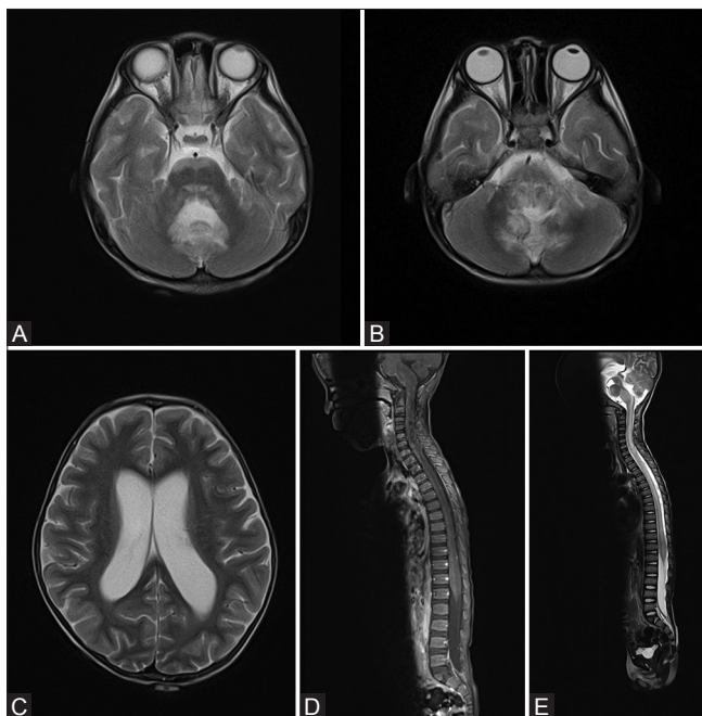
Figure 1 (A-E): (A-C) First MRI brain showed T2W hyperintense signal in anterior pons, medulla and bilateral cerebellar hemispheres. Obstructive hydrocephalus is evident. No abnormal signal is seen in bilateral cerebrum. (D and E) First MRI spine showed generalized swelling and increase in T1W hypointense and T2W hyperintense signal affecting the whole spinal cord

Patient's hypertension was difficult to control. It required titration of multiple antihypertensive medications. Initially, the patient was dependent on intravenous infusion of